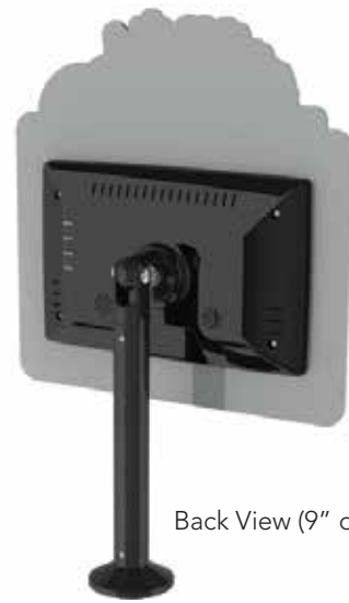
Back View (9" or 5.5" Pole Option)